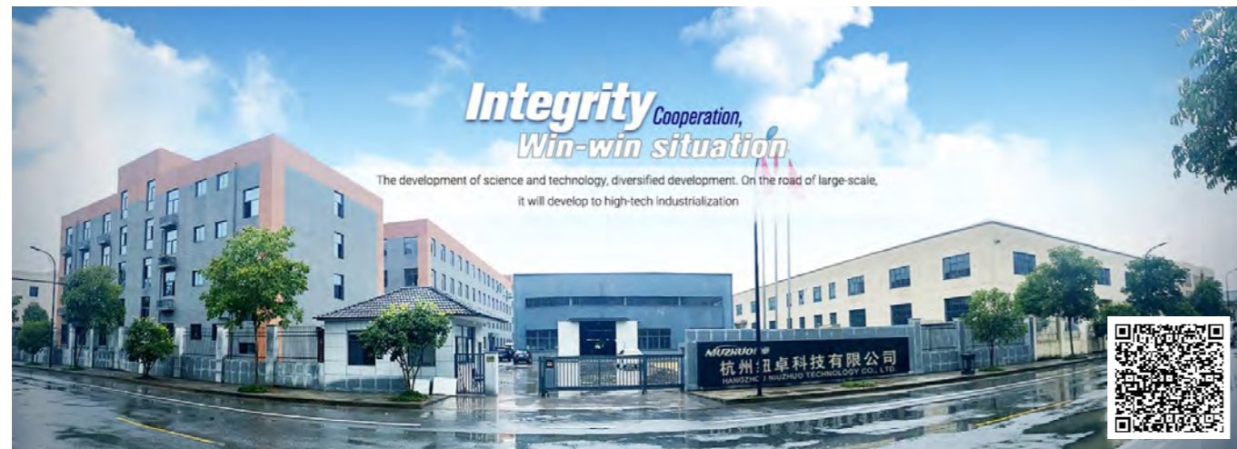
*Scan QR Code Visit Our Factory